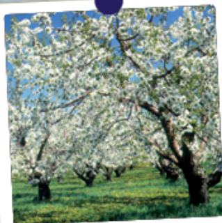
CHERRY ORCHARD IN BLOOM