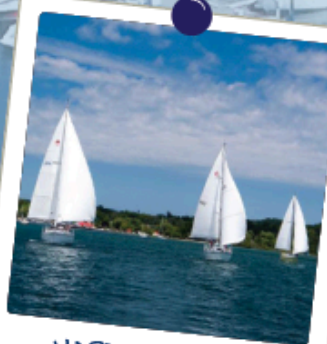
NORTHPORT RAY YACHT CLUB REGATTA