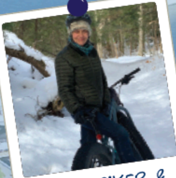
SNOW BIKER & XC SKI TRAIL