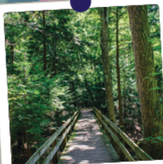
LEELANAU STATE PARK TRAIL