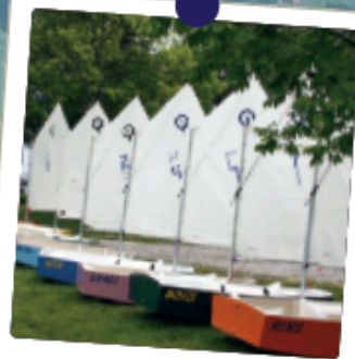
NORTHPORT YOUTH SAILING SCHOOL